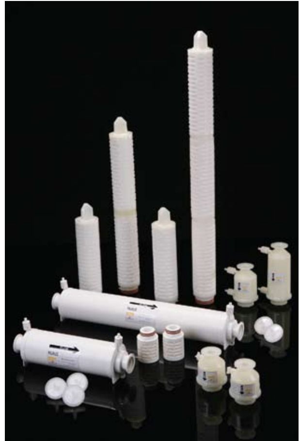
Note: TETPOR is a registered trademark of Parker domnick hunter