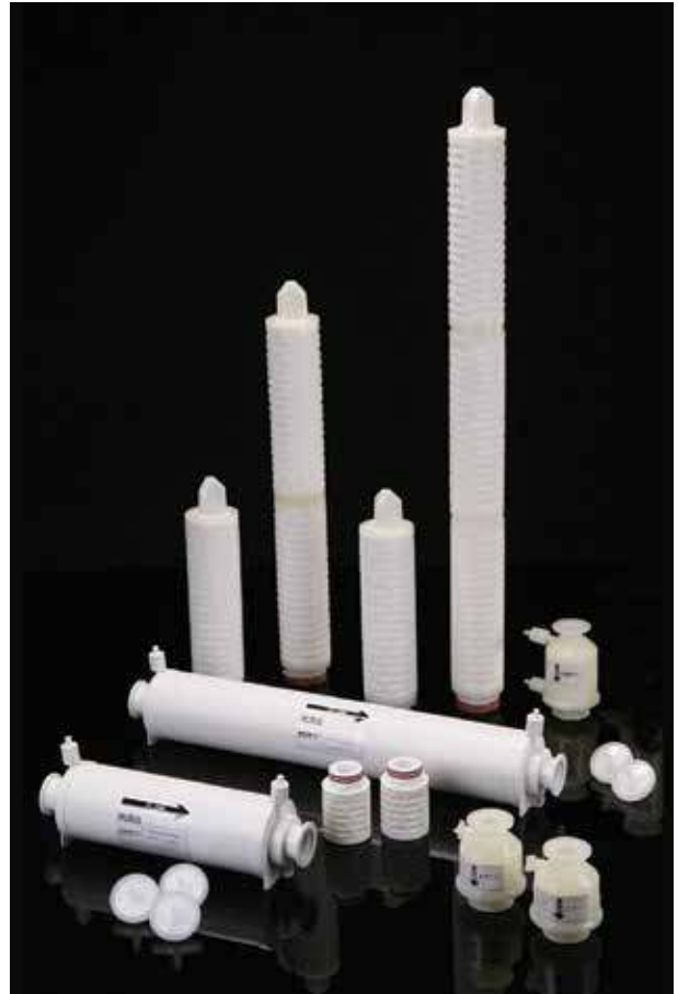
Note: TETPOR is a registered trademark of Parker Hannifin Corporation.