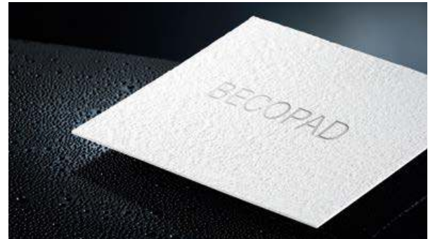
Water throughput BECOPAD P range

BECOPAD P depth filter medium is therefore suitable for applications involving mechanical separation of particles and adsorptive retention of negatively charged particles. Due to the minimum endotoxin contents and the increased endotoxin reduction the filter medium is ideal for pharmaceutical processes.