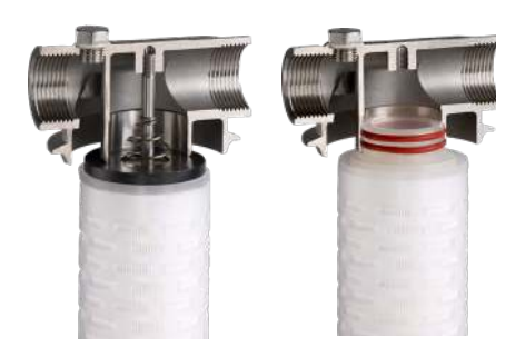
Double Open Ended

The 53A Series will accept the full range of Amazon and industry standard cartridges ranging from 0.1 to 500µm with nominal lengths of 5, 10, 20 and 30".