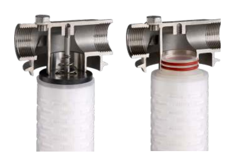
Double Open Ended