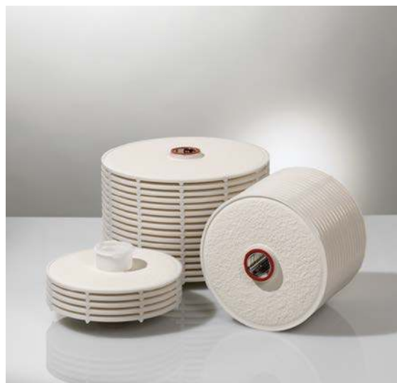
Water throughput BECODISC BT range

Polishing filtration of concentrated sugar solutions of approx. 65 °Brix and filtration of edible oils, vegetable extracts, liquid gelatin, and ointment bases consisting of primary products, oils, varnishes, polymer dispersions and separation of bleaching earth. Possible applications also include removing of activated carbon. Depending upon particle distribution of the activated carbon a single step filtration is possible.