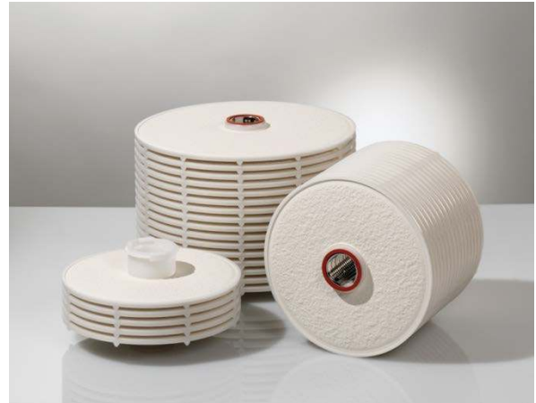
Water throughput BECODISC BP range