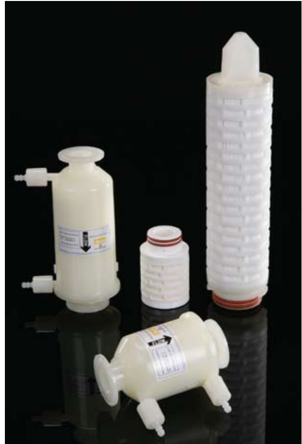
Note: BEVPOR is a registered trademark of Parker domnick hunter